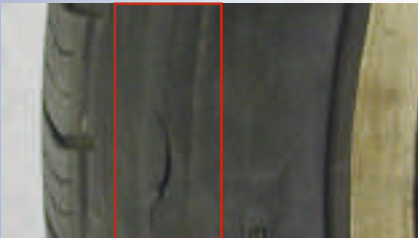
Tires with cuts, cracks or bulges in the sidewall or tread should be replaced.