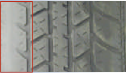
Uneven tread wear can be caused by improper wheel alignment or a tire imbalance.

Tires with deep cuts, slits, cracks, blisters or bulges are potentially dangerous and should be replaced. Tires with treads worn down to the same level as the tread wear indicator (1.5 mm or \frac{2}{32} of an inch in depth) must be replaced.