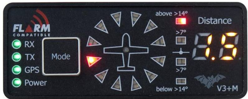
Example of FLARM display provided by FLARM Technology Ltd.

Of course, technology is only an aid to collision avoidance, and pilots remain primarily reliant on the principle of see-and-avoid, which always requires vigilance and collaboration. Pilots are always welcome to visit glider operations to learn about them and share about themselves. Most Canadian glider fields require prior permission (PPR) for landing so make sure to call ahead. To find a glider field near you, go to www.sac.ca . △