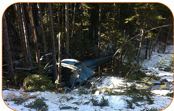
Impact site

On 13 May 2014, an Eurocopter AS 350 BA helicopter was on a flight to inspect power-line vegetation encroachment with a pilot and an observer on board. The flight surveyed a 25-kilovolt power distribution line, which ran adjacent to a service road leading to Hydro-Québec's Sainte-Marguerite power dam. While completing a right turn in a valley, the pilot noticed a 315-kilovolt power transmission line crossing perpendicular to the direction of flight. The right turn was increased to avoid the transmission line, but one of the helicopter's main rotor blades struck the lower wire. The resulting damage to the rotor blade caused severe vibrations, which made it difficult to control the helicopter. While on approach to land in a small clearing under the 315-kilovolt transmission line, the helicopter's skid gear contacted trees. The helicopter rolled to the left and fell approximately 50 ft through the trees, coming to rest on its left side in the snow. Both occupants sustained serious injuries, yet were able to exit the aircraft. The helicopter was substantially damaged. The 406-megahertz emergency locator transmitter activated on impact. The Cospas-Sarsat International Satellite System for Search and Rescue did not receive a signal until 25 min after the accident. There was no post-impact fire. The accident occurred in daylight hours at 1020, Eastern Daylight Time.