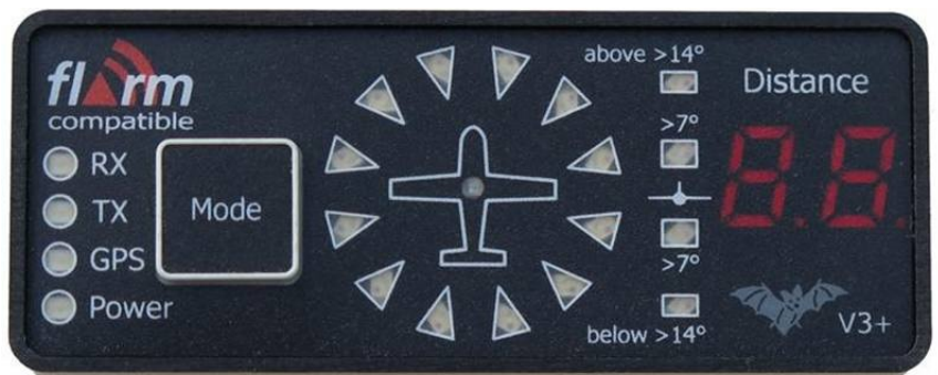
Example of FLARM display provided by FLARM Technology Ltd.