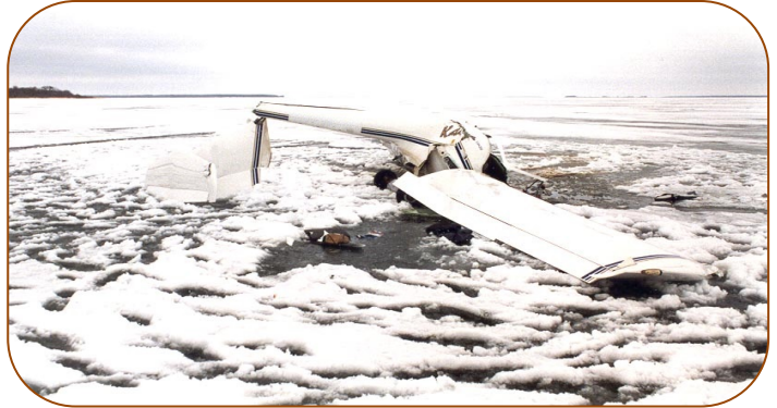
DA20 accident at Lake Manitoba in February 1998 (TSB file A98C0030)

At first glance, these two accidents appear to have nothing in common. However, both are examples of flights that may have proceeded without an adequate risk assessment.