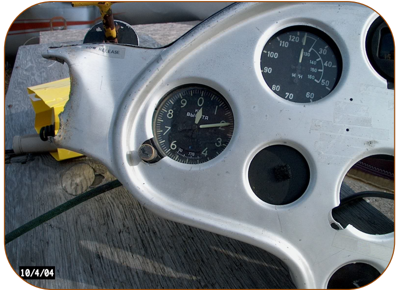
Rear instrument panel from the Blanik, showing the altimeter in meters.

The coroner also encountered difficulties in tracking down the true status of the instructor’s medical certificate. While it was eventually determined that the instructor’s medical certificate was adequate to instruct on gliders, the coroner recommended that all flying clubs, schools and flying associations require that a copy of each member’s most current medical certificate(s) be kept on file prior to any flying. △