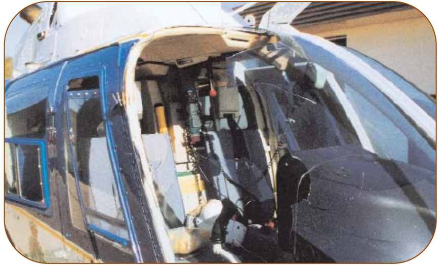
An impact with a Western Grebe (3 lbs) caused considerable damage to this helicopter. The bird struck the pilot in the face.

Analysis of BSIS data demonstrated that nearly half (46%) of damaging bird strikes involved gulls or geese. In addition, larger birds were most likely to cause damage to aircraft (see Figure 2 and Table 2). Analysis of this database demonstrates that the average damaging strike involved birds with an average mass of 1.9 kg (or 4.2 lb) while the median mass of birds that caused damaging strikes was 995 g (or 2.2 lb), the average size of a red-tailed hawk. Between 2005 and 2014, 32% of damaging strikes in Canada involved bird species weighing more than four pounds. Aircraft certification standards require aircraft to sustain strikes up to 4 pounds (1.8 kg). For this reason, airports should strive to keep the average weight of bird species struck at Canadian airports below 1800 g.