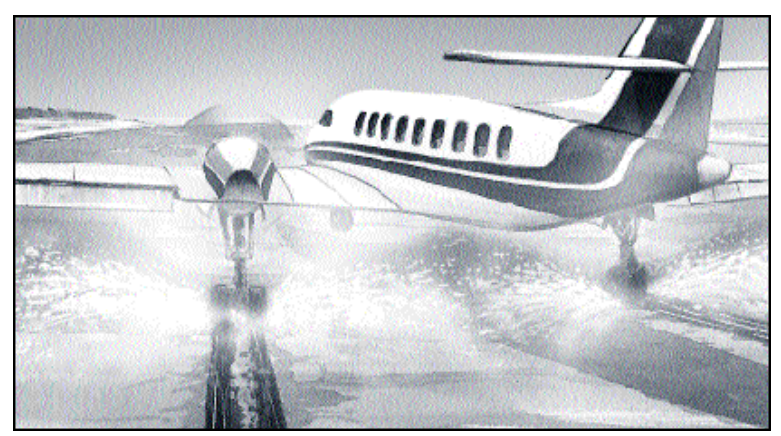
Just a bit of slush can seriously affect aircraft control.

Flying in Canada during the winter months requires that all airport operators, air traffic control units, airline dispatch agencies and pilots in particular, pay extra attention not only to the most current weather conditions at departure, destination, and alternate airports, but to the most current Airport Movement Surface Condition Reports (AMSCRs) for each. Principally, under changing severe weather conditions it is of the utmost importance for pilots to receive the most accurate, complete and current runway surface condition (RSC) and Canadian Runway Friction Index (CRFI) reports from the appropriate