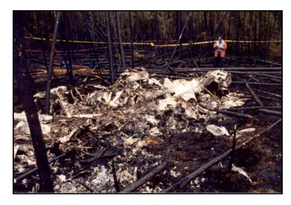
40-ft long by 10-ft wide slash through trees at an angle of 42^{\circ} from horizontal.

The wreckage was examined on site, to the extent possible, because of destruction by impact and fire. No pre-existing defects could be found. The main wreckage trail was about 100 ft long, preceded by a